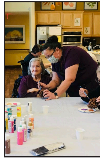
Enjoying activities with staff