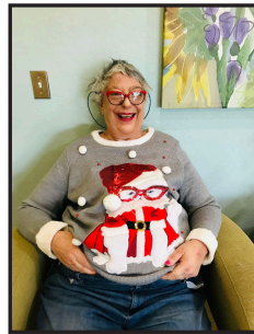
In the holiday spirit!