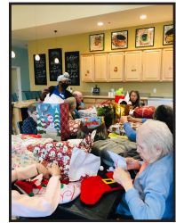
Christmas in Goodyear