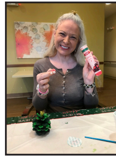
Having a blast with holiday activities