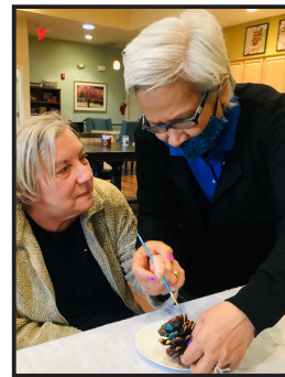
Painting pine cones