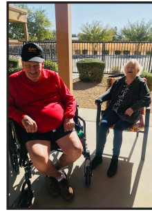
Enjoying holiday season fun!